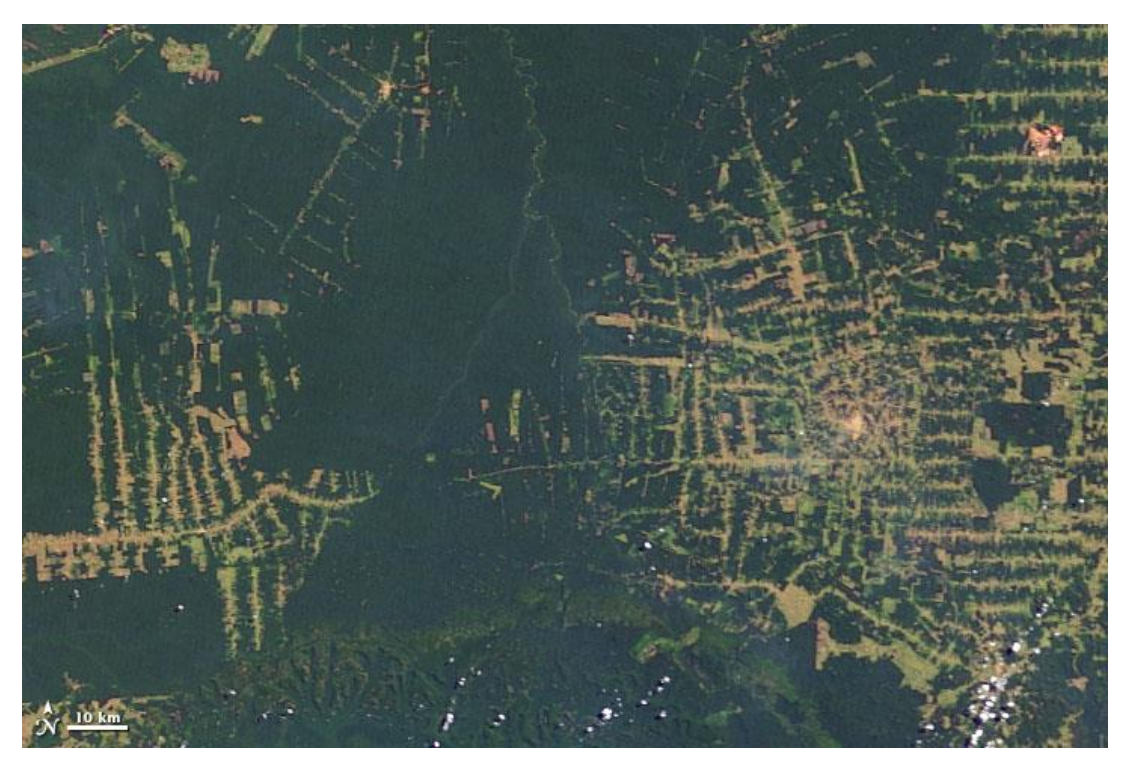
21 de Julio de 2003