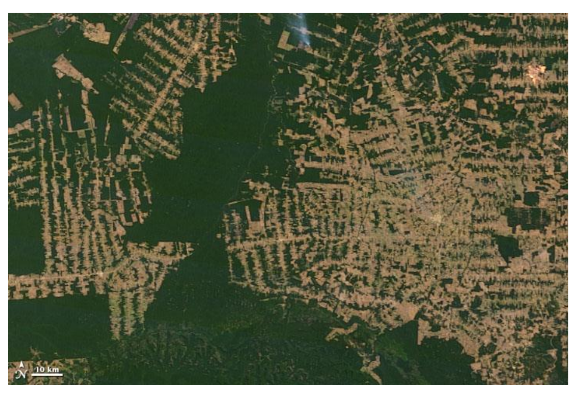
5 de Agosto de 2011