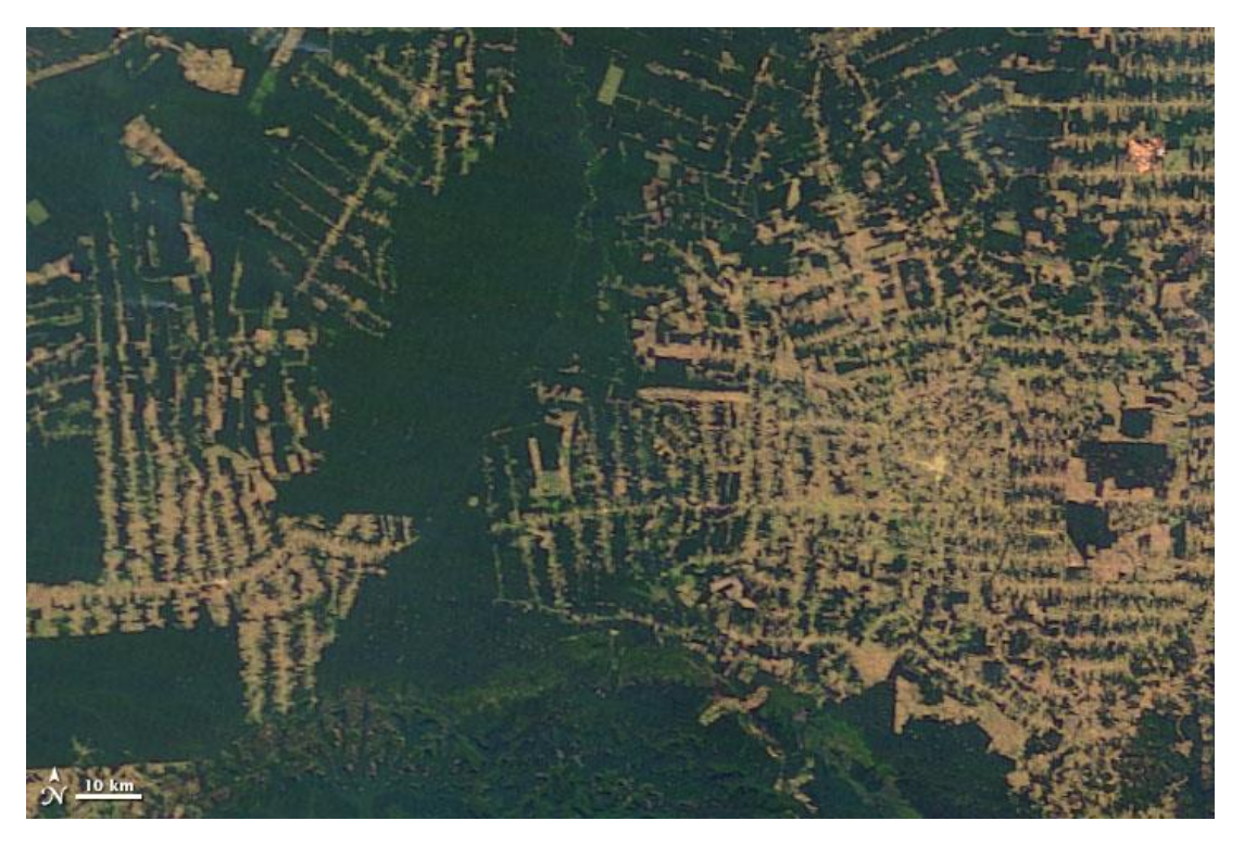
17 de julio 2006