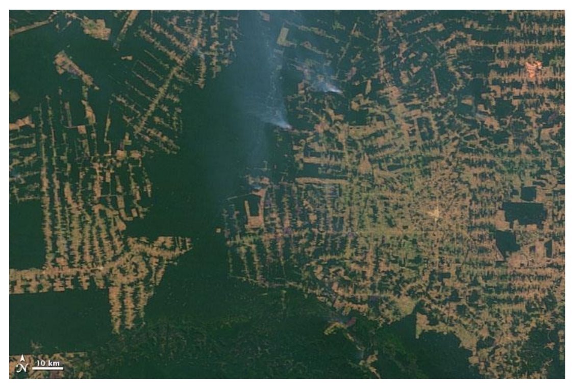
12 de Agosto de 2007