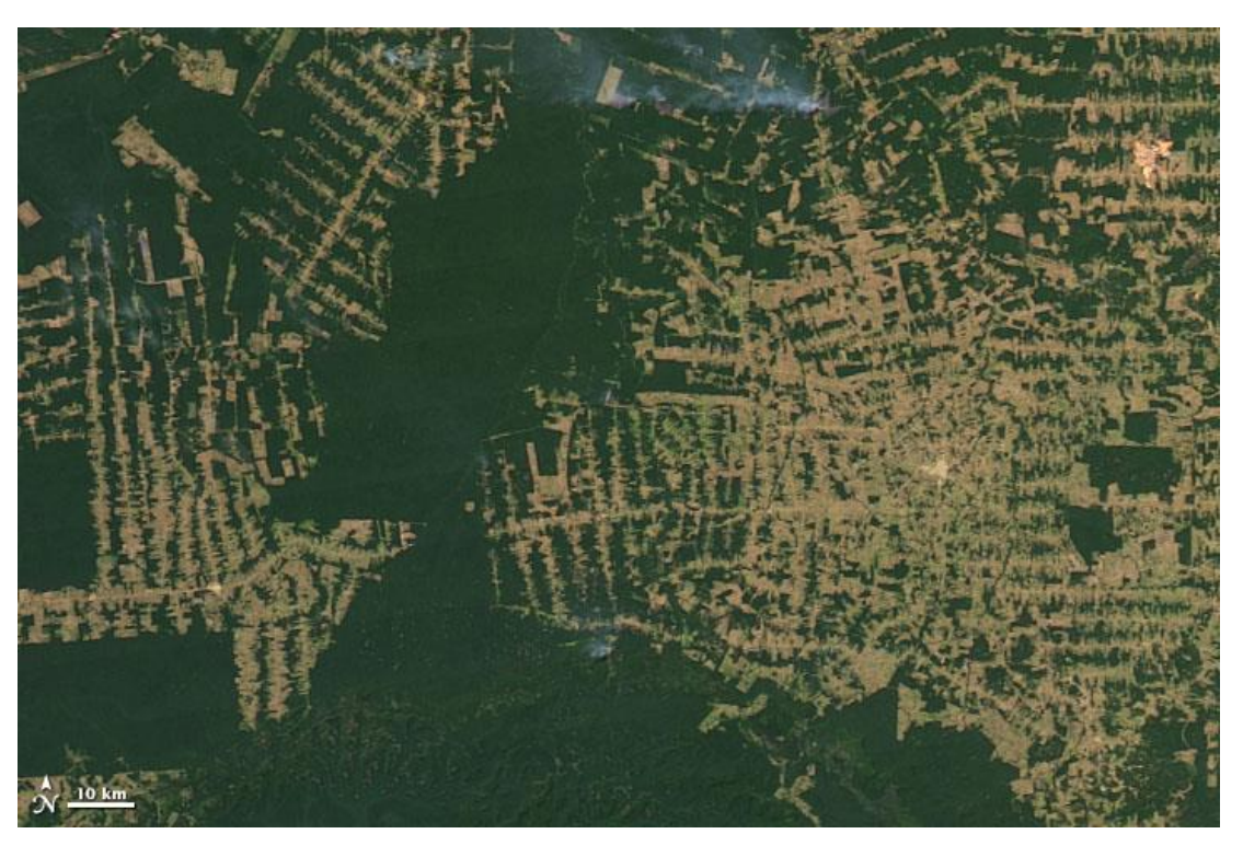
21 de Agosto de 2009