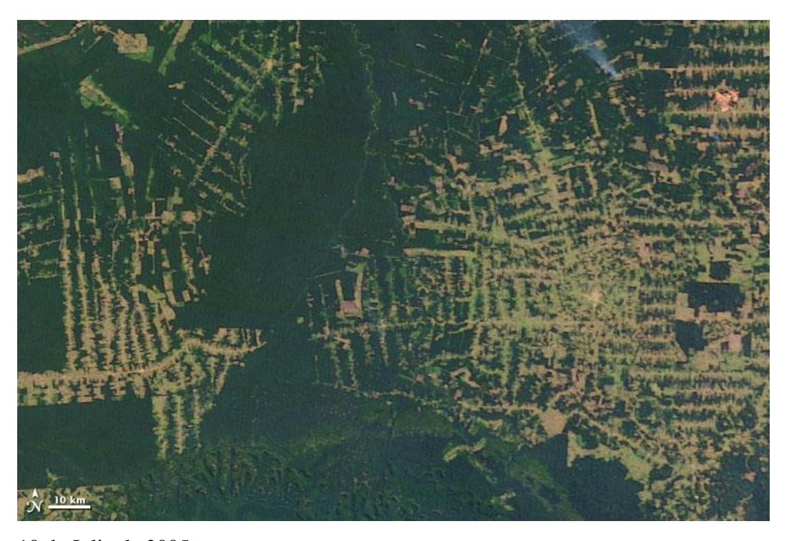
10 de Julio de 2005