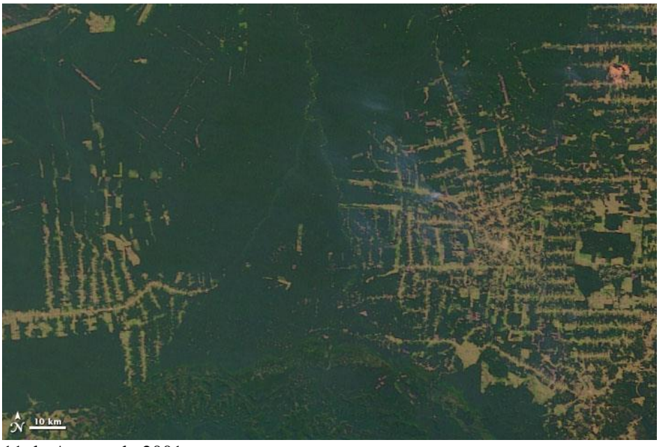
11 de Agosto de 2001