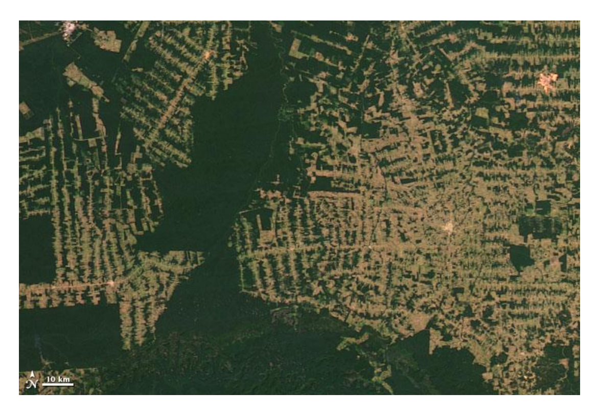
18 de Julio de 2012

The state of Rondônia in western Brazil — once home to 208,000 square kilometers of forest (about 51.4 million acres), an area slightly smaller than the state of Kansas — has become one of the most deforested parts of the Amazon. In the past three decades, clearing and degradation of the state's forests have been rapid: 4,200 square kilometers cleared by 1978; 30,000 by 1988; and 53,300 by 1998. By 2003, an estimated 67,764 square kilometers of rainforest—an area larger than the state of West Virginia—had been cleared.