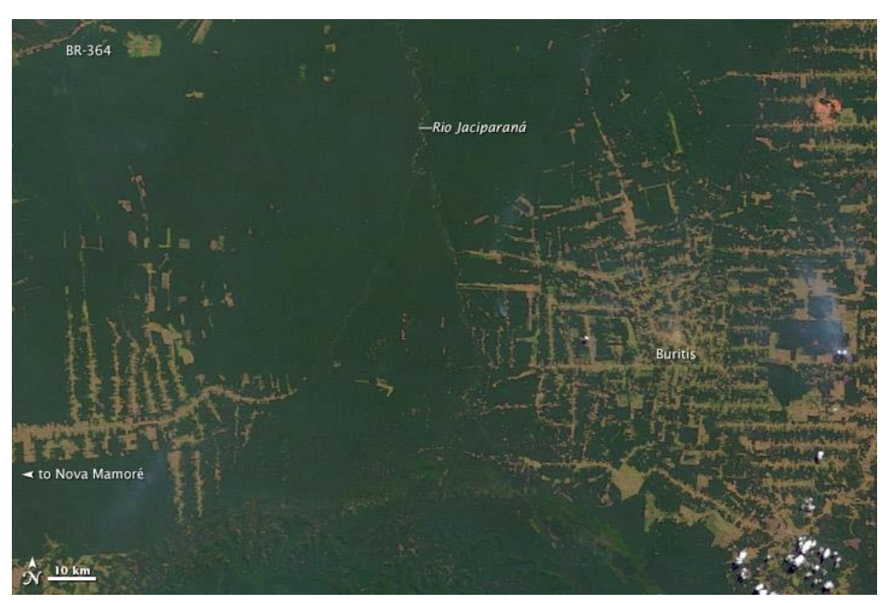
30 de Julio de 2000