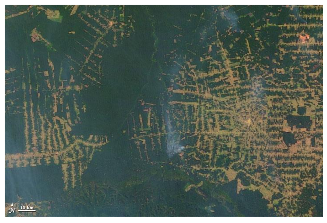
1 de Agosto de 2004