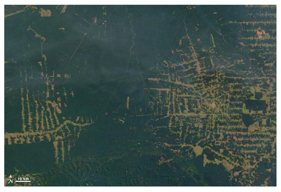
11 de Julio de 2002