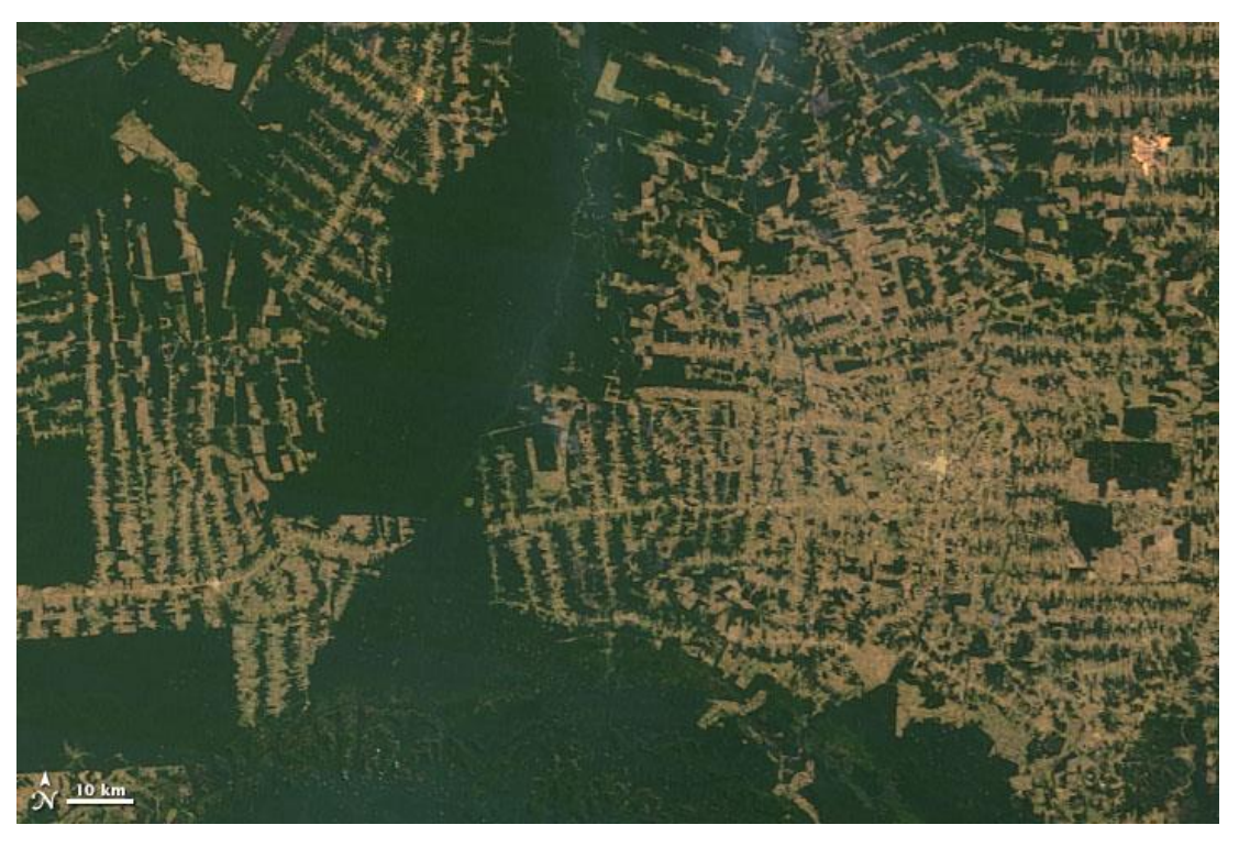
2 de Agosto de 2010