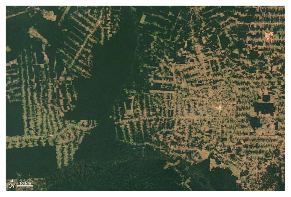
25 de Julio de 2008